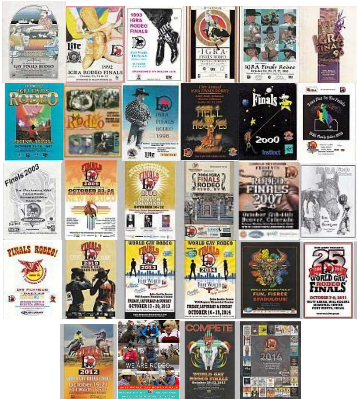
World Gay Rodeo Finals® Through the years